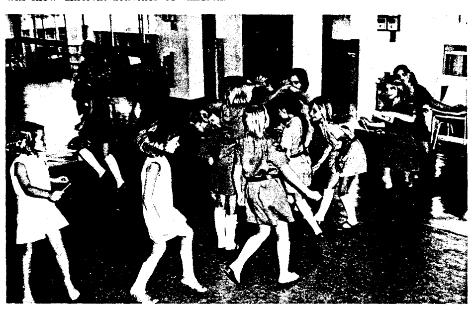
Above A Brownie meeting in Hong Kong Below Girl Scouts play with children at Gualupita, Mexico/Photo du haut Une réunion de jeannettes à Hong Kong Photo du bas Des éclaireuses jouent avec des enfants à Gualupita au Mexique/Arriba Una reunion de Alitas en Hong Kong Abajo Muchachas Scouts juegan con los niños en Gualupita. México.

The Association is a member of the National Commission for IYC, whose plans are centred on a joint approach to the Government, asking it to do everything possible to improve the quality of family life in South Africa. The children in the Movement are to be encouraged to make and keep friends in a variety of ways. Participation in this scheme will entitle a Brownie, Guide or Ranger to wear a badge incorporating the IYC logo.